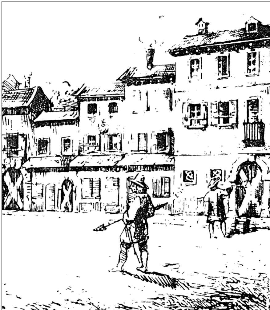
The marking of infected houses in Gorizia

Carniola, given a conspicuous rise in deaths in Kočevje , where no news of a suspected plague had been issued since 1599. In the first register of deaths kept by the parish of Kočevje, the oldest such register in Lower Carniola, attention is drawn to the first four years from the beginning of 1669 to the end of 1672, when 317 persons were buried, forty-four from the town of Kočevje. Over the next six years between 1673 and including 1678, the number of deaths and burials amounted to no more than 287, only twenty-seven in the town itself. Although not particularly striking, the contrast between the number of deaths in the first four and the ensuing six years of keeping the death register shows notable differences in the number of deaths by individual years and significant fluctuations among the town dwellers. In 1669, the town of Kočevje registered no less than twenty of altogether seventy-three deaths across the entire parish. Only four deaths were registered in 1670 and two in 1671, after which the number of burials rose again, reaching eighteen in 1672. It is interesting to note that the town itself never counted more than