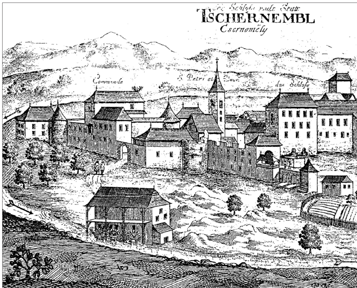
Črnomelj according to Valvasor, ten years before the plague of 1691; in the center of the town stands the parish Church of St. Peter and Paul with the adjacent cemetery where the plague victims were buried.